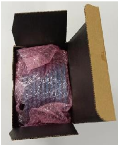
卷盘装盒 Put reels into box.