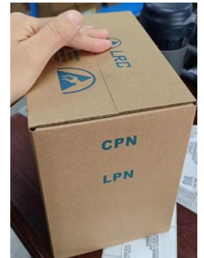
对称摇盖封盒 symmetrical swing lid box

包装盒尺寸: 188*130*185mm Size of Box: 188*130*185mm