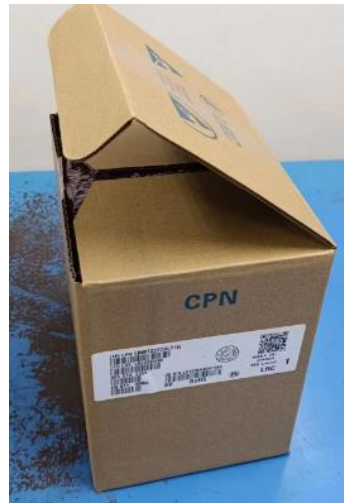
侧盖封盒 Side-Open Box

包装盒尺寸: 187*139*185mm Size of Box: 187*139*185mm