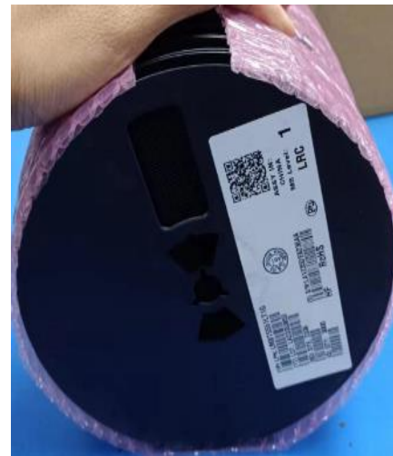
条状气泡袋环包产品 Wrap reels with bubble strip.