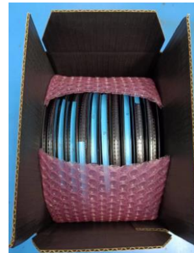
卷盘装盒 Put reels into box.