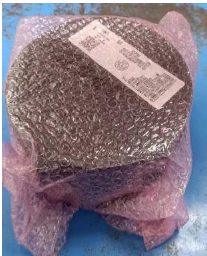
气泡袋包裹产品 Wrap reels with bag.